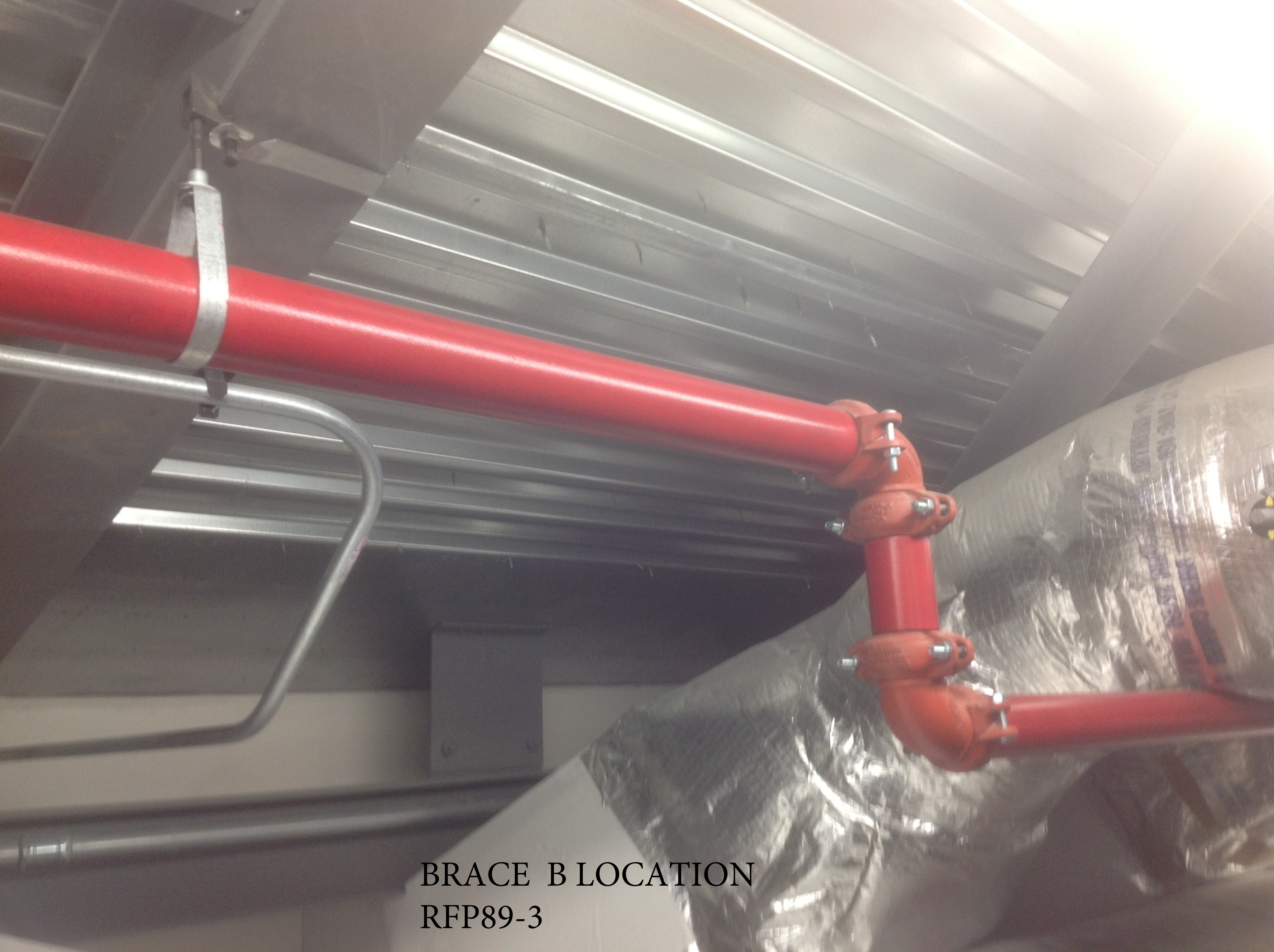
BRACE B LOCATION RFP89-3